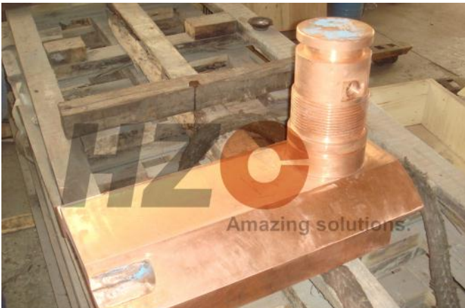
Conductive plate for INTECO Nickel ferroalloy furnace